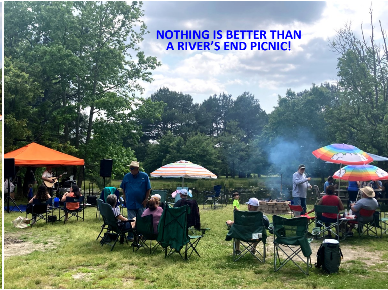
NOTHING IS BETTER THAN A RIVER'S END PICNIC!