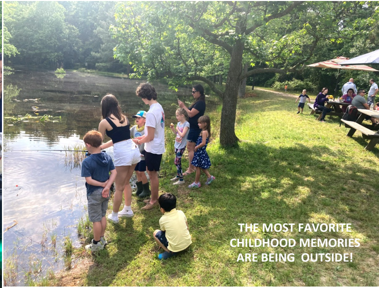
THE MOST FAVORITE CHILDHOOD MEMORIES ARE BEING OUTSIDE!