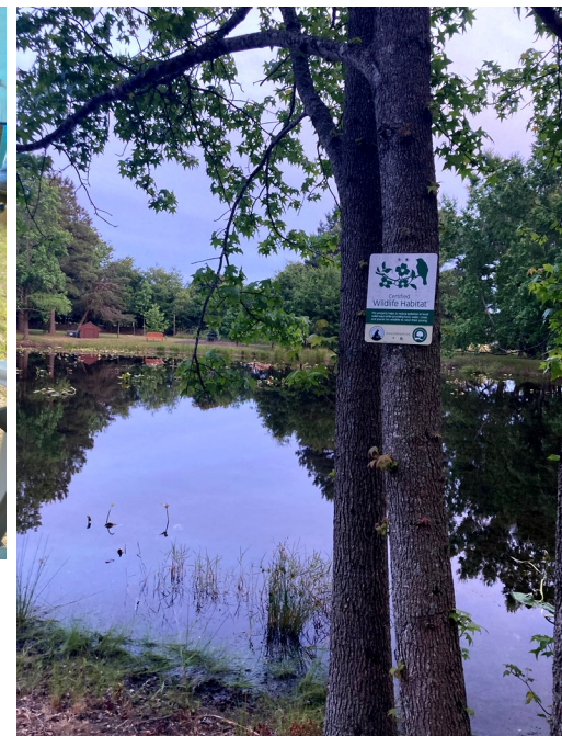
The 95 acres of green space in River's End was awarded the Certified Wildlife Habitat designation by the Delaware Nature Society and the National Wildlife Federation. The certification recognizes properties that support nature and the environment by providing food, water, and shelter for wildlife and minimizing the use of fertilizers and pesticides.