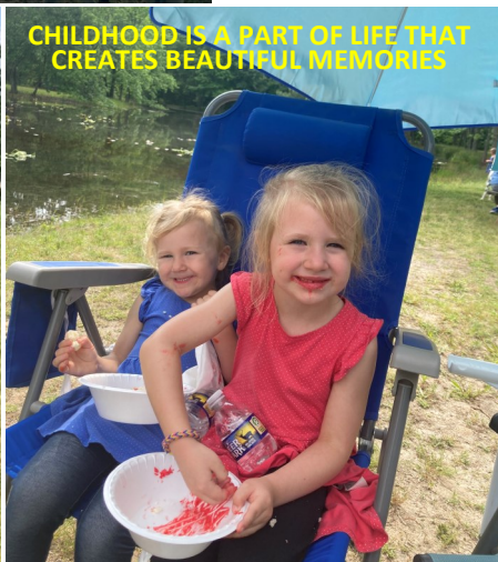
CHILDHOOD IS A PART OF LIFE THAT CREATES BEAUTIFUL MEMORIES