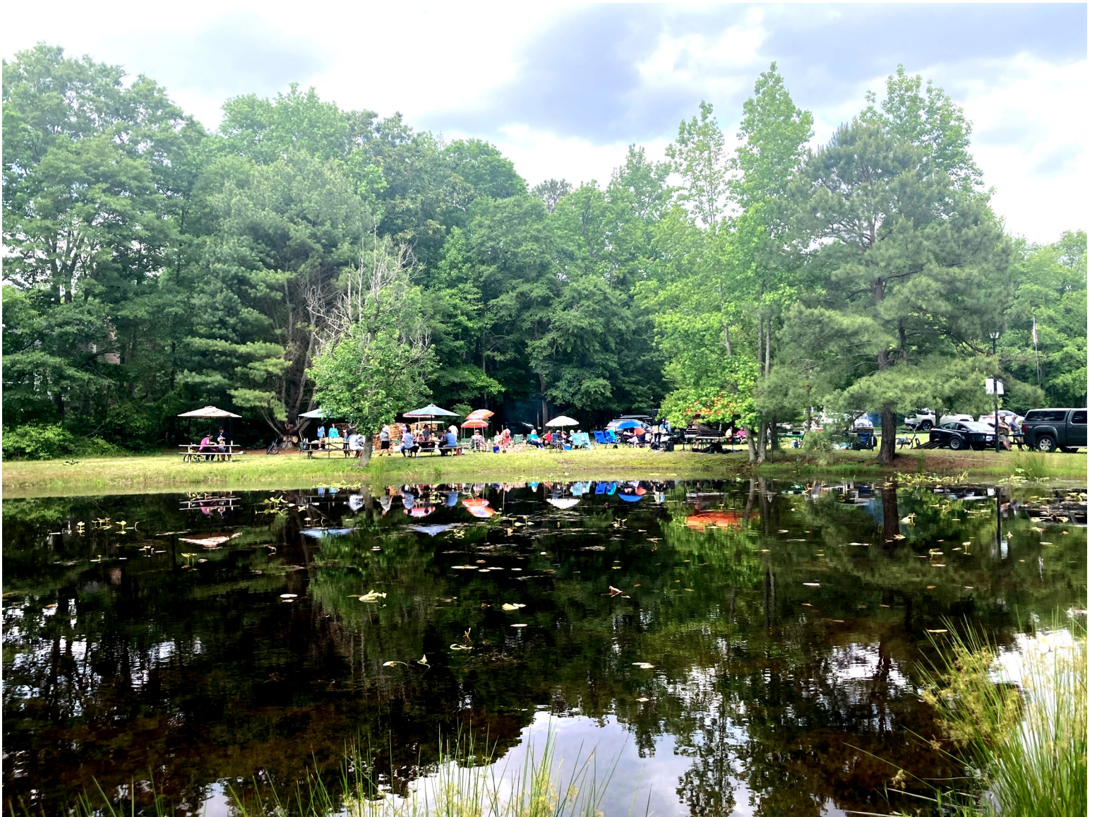
On Sunday, May 21, 2023 a Spring Picnic was held for the River's End Community at the pond. A scavenger hunt with prizes was organized, as well as games for all, live music and great food.