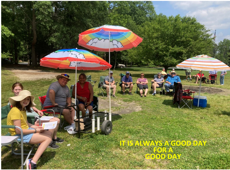
IT IS ALWAYS A GOOD DAY FOR A GOOD DAY