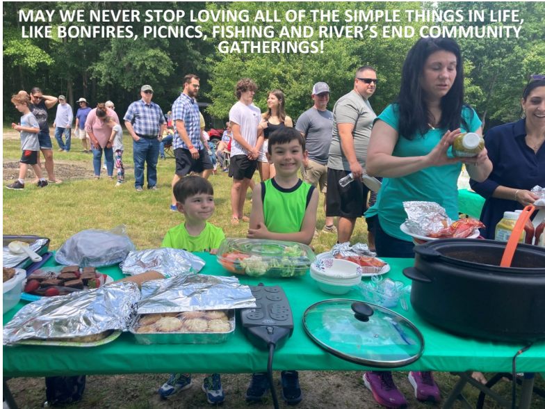
MAY WE NEVER STOP LOVING ALL OF THE SIMPLE THINGS IN LIFE, LIKE BONFIRES, PICNICS, FISHING AND RIVER'S END COMMUNITY GATHERINGS!