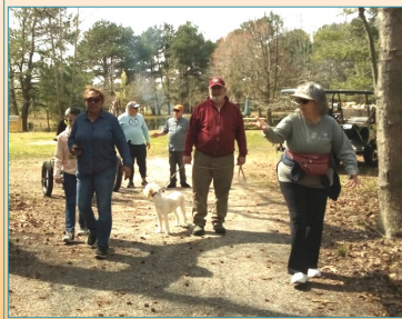
River's Enders participated in the first annual "Egg-Cellent" Bunny Hop and Roll on March 30. Several residents enjoyed the gorgeous Spring weather!

Please visit River's End website at www.riversend.org for information about upcoming events and the Community Cares Team (CCT).