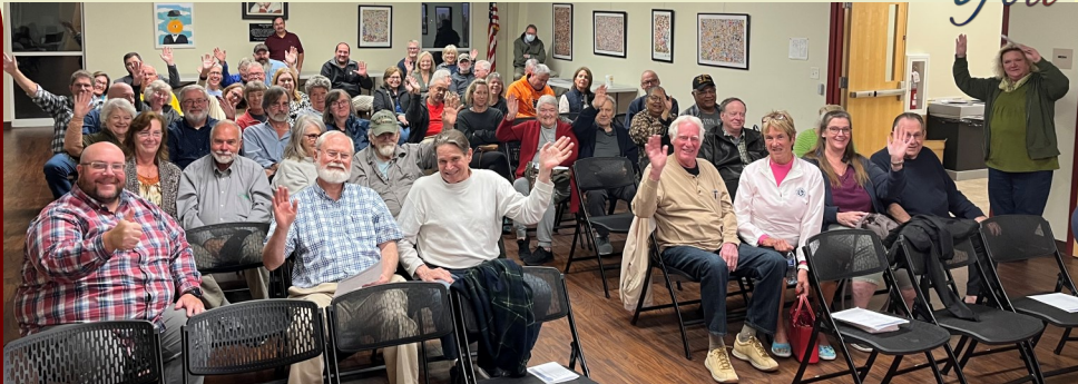
River's End residents attending the annual meeting to vote in new board members